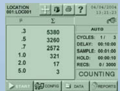
Backlit Touchscreen Interface