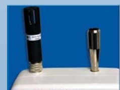
Removable Temp/RH and Isokinetic Probe