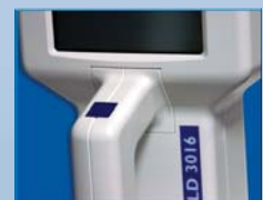
One-handed Operation with Start & Stop on Handle