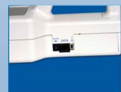
Easily Download Data to PC