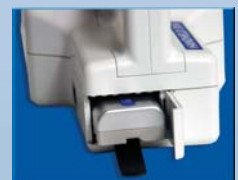
Removable Rechargeable Li-Ion Battery